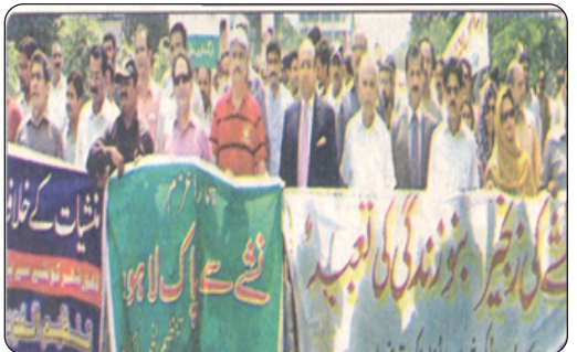
26 th June, 2014, Awareness walk organized in collaboration with Tanzeem Al-Fajar Pakistan, Lahore.