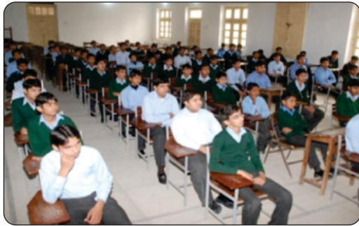
11 th April 2014 at Govt Islamia High School, Attock City