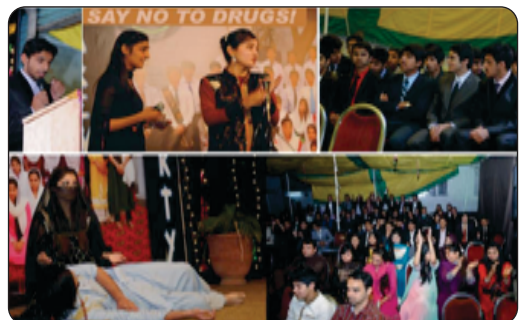
28th May 2014, DFCL organized a lecture cum drama at Nobel Academy, Johar Town, Lahore