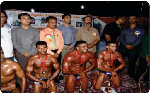
24 th June 2014, Organized a Body Building Championship at Bee Amma Park, North Karachi