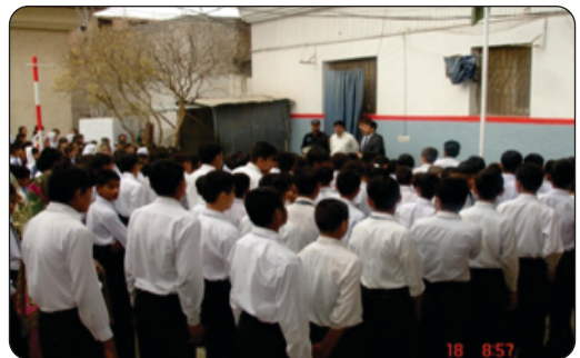
18 th April 2014, Organized a lecture at Muslim Public School, Bara Gate, Peshawar Cantt