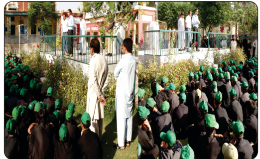
24 th April 2014, Organized a lecture at Govt Islamia Higher Secondary School No. 2, D.I.Khan.