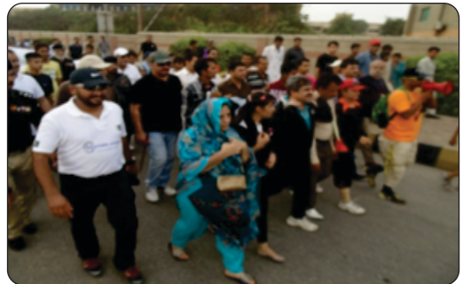
22 nd June 2014, RD ANF, Sindh organized awareness walk at Sea View, Karachi