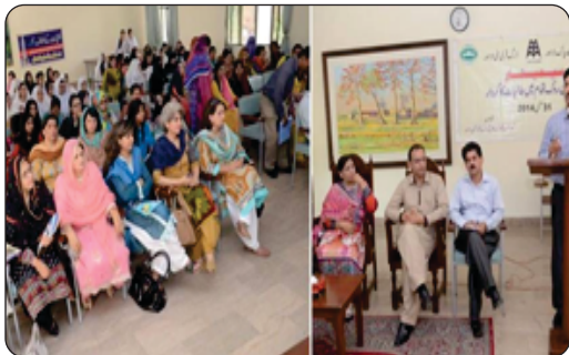
31 st May 2014, DFCL organized a seminar at Govt. College for Women, Gulberg, Lahore