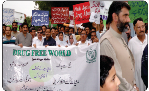
11 th June 2014, at Govt College for Girls, F-Block, Satellite Town, Rawalpindi