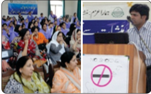
30 th May 2014, DFCL organized a seminar was at Govt. College for Women, Mustafa Abad, Dharam Pura, Lahore