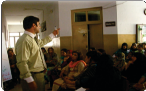
11 th June 2014, at Govt College for Girls, F-Block, Satellite Town, Rawalpindi