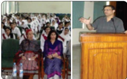
23rd April 2014, DFCL organized a lecture at DHA Senior School, Phase V, Lahore