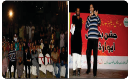
18th to 20th April 2014, DFCL organized a 3 x days Family Festival at Model Town Park, Lahore