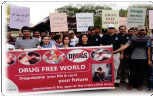
22 nd June 2014, RD ANF, Rawalpindi organized awareness walk at F-9 Park, Islamabad