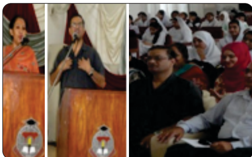
27 th May 2014, DFCL organized a seminar at Govt. Post Graduate College for Women, Samanabad, Lahore