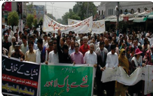
26 th June 2014, DFCL organized a walk from Liberty Market to Qaddafi Stadium, Lahore