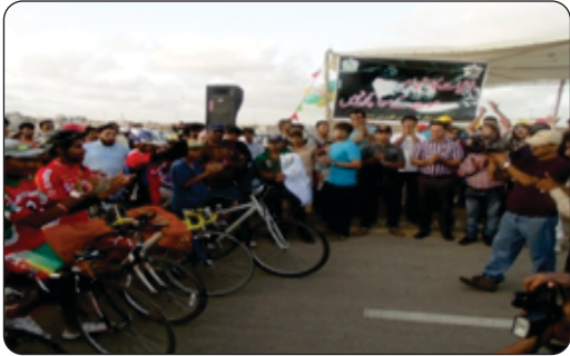
15 th June 2014, Organized a Cycle Race at Sea View, Karachi