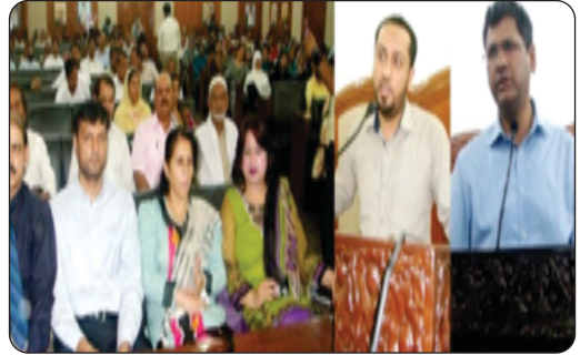
31 st May 2014, DFCL organized a seminar at Town Hall, Lahore