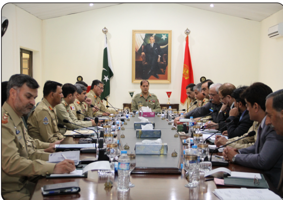
Force Commander Conference 26 May 2014