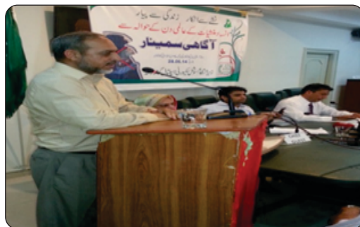
28 th June 2014, Anti Drug Awareness Seminar at Gujranwala