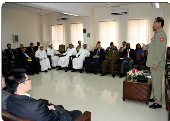
Get Together with all DLOs at ANFA 9 April 2014