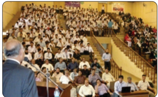
9 th June 2014, DFCL organized a seminar at MAO College, Lahore