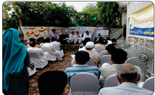
23 rd June 2014, DFCL organized a lecture at Model Town, Lahore