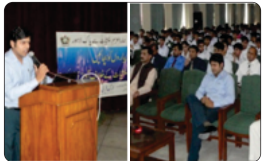
25th April 2014, DFCL organized a lecture at DHA Senior School, Phase V, Lahore