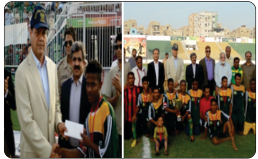
16 th April 2014, Organized a Football Tournament at Peoples Football Stadium Lyari, Karachi