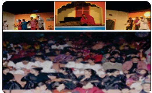
13th to 15th May 2014, DFCL organized a 3 x days Stage Play at Al-Hamra Art Centre, the Mall, Lahore