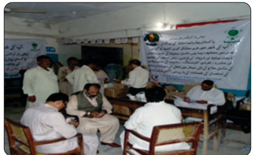
4 th June 2014, a Free Medical Camp for Drug Addicts in Umer Kot, Sindh