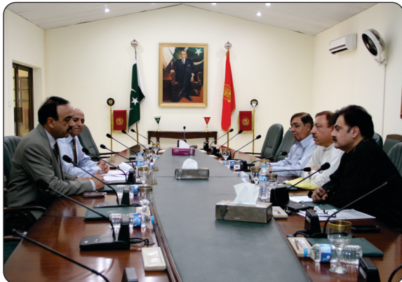
Dir Enforcement Meeting with Chamber of Commerce - 12 Jun 2014