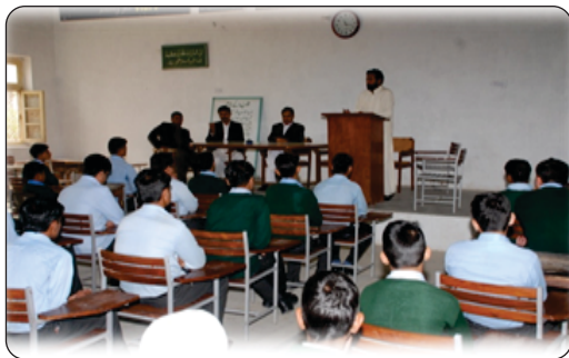
17 th April 2014, at Govt High School & College, Jagir Basin, Gilgit