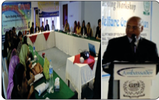
5 th and 6 th April 2014, DFCL organized a 2 x days training workshop at Ambassador Hotel, Lahore