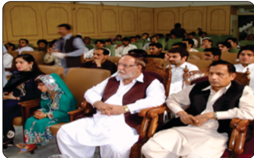
20 th April 2014, Organized a Musical Show at Directorate of Archive and Library Peshawar.