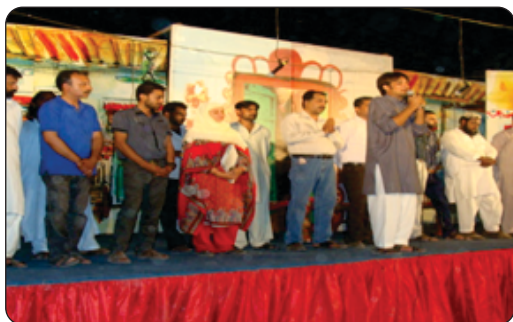
On 27 th June 2014, Organized Anti Drug Drama at Multan