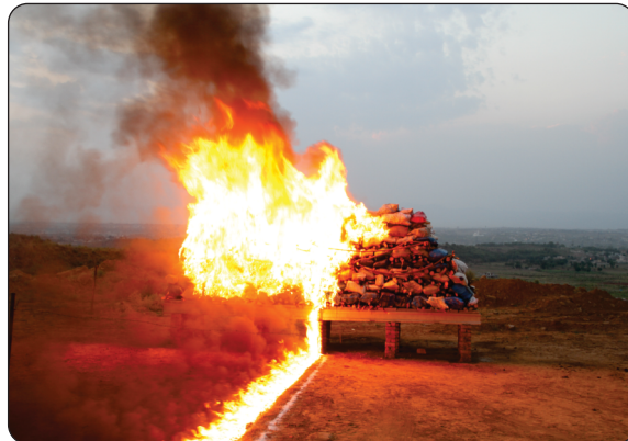
Drug Burning Ceremony 26 Jun 2014