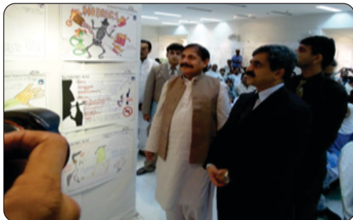
30 th May 2014, Organized a Poster Competition by RD ANF, Sindh in Karachi Arts Council