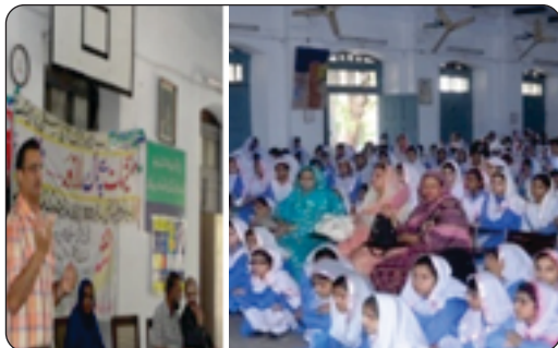
8 th May 2014, DFCL organized a seminar at Government Girls Inter College, Ravi Road, Lahore