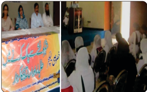
20 th June 2014, DFCL organized a seminar at Pakistan Girls Guide Association, Habib Ullah Road, Lahore