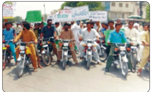
20 th June 2014, Organized a rally at Multan